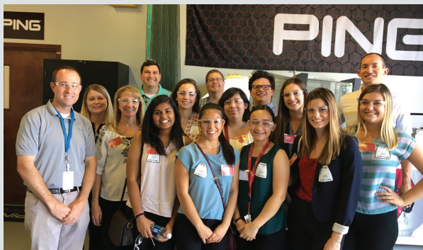
PwC Connect students touring PING facility

Applicants also participate in the PwC Challenge Competition. We had 12 freshman participate in 2017. Visit our website to learn more about the program.