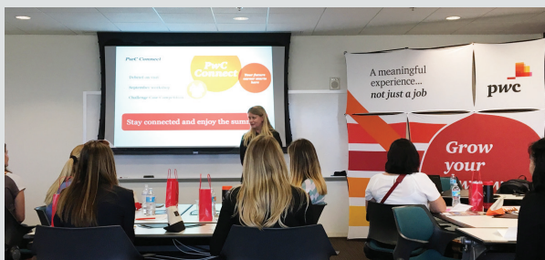
PwC Connect students in PwC's Phoenix office