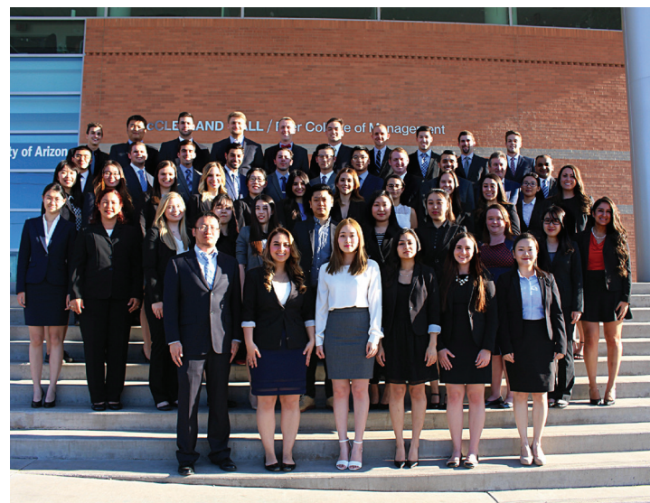
MAcc and MSA Spring 2017 Graduates

In fall 2017, we launched two online programs: The Master of Science in Accounting is now available online, with 6-7 accounting courses and the remaining courses being taken through online MBA electives. Our other program is a Graduate Accounting Certificate, which allows students to take nine credit hours of accounting as part of our online program. We enrolled 12 students in our online programs this fall and look forward to rapid growth in the program.